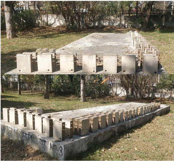
Figure 2: RCC samples in field environment for durability study

chloride ingress values below 1,000 coulombs in RCPT tests. Reinforcement corrosion studies confirmed passive behavior in moderate exposure environments when mix design and curing were adequately controlled. These results demonstrated that substantial clinker reduction is feasible without compromising durability, provided performance-based criteria are applied. The generated data have contributed to durability-linked provisions and clinker substitution limits in the ongoing revision of IS: 456 and draft low-carbon cement standards, supporting a transition from prescriptive cement composition requirements to exposure-based performance specifications.